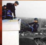
OTTAWA POLICE SERVICE TACTICAL & EXPLOSIVES UNIT & CANINE UNIT L'ÉQUIPE TACTIQUE ET L'ÉSCOUADE CANINE DU SERVICE DE POLICE D'OTTAWA