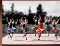
HIGHLAND DANCERS LES DANSEURS ÉCOSSAIS