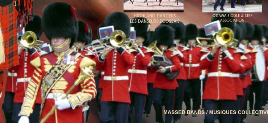
MASSED BANDS / MUSIQUES COLLECTIVES