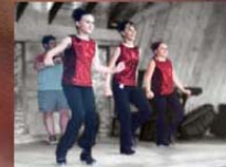
OTTAWA FIDDLE & STEP ASSOCIATION