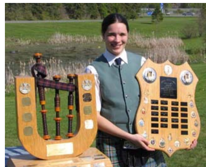
Allison MacDonald Special Services Force Trophy Cameron Highlanders Trophy Open Piobaireachd Piper of the Day