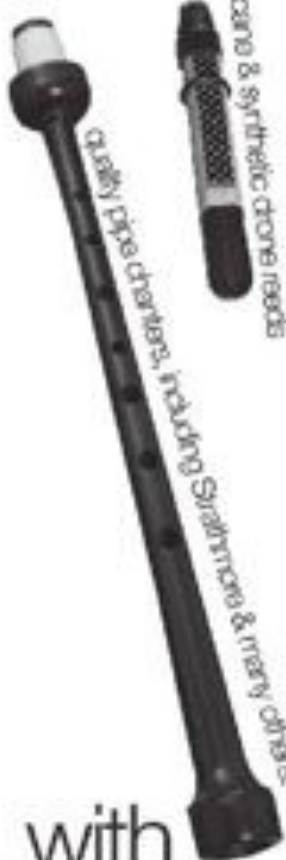
Quality pipe chanters, including Strathmore & many others Cano & Synthetic drone reeds

some of the best sounding bagpipes on the market - Strathmore, Gibson, McCallum, David Niel & Co, and Dunbart